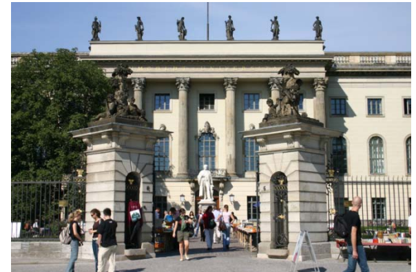
Humboldt-Universität, Unter den Linden

Many sightseeing spots, such as the Reichstag, the Brandenburg Gate, the Museum Island and the Gendarm Market are within walking distance to the venue.